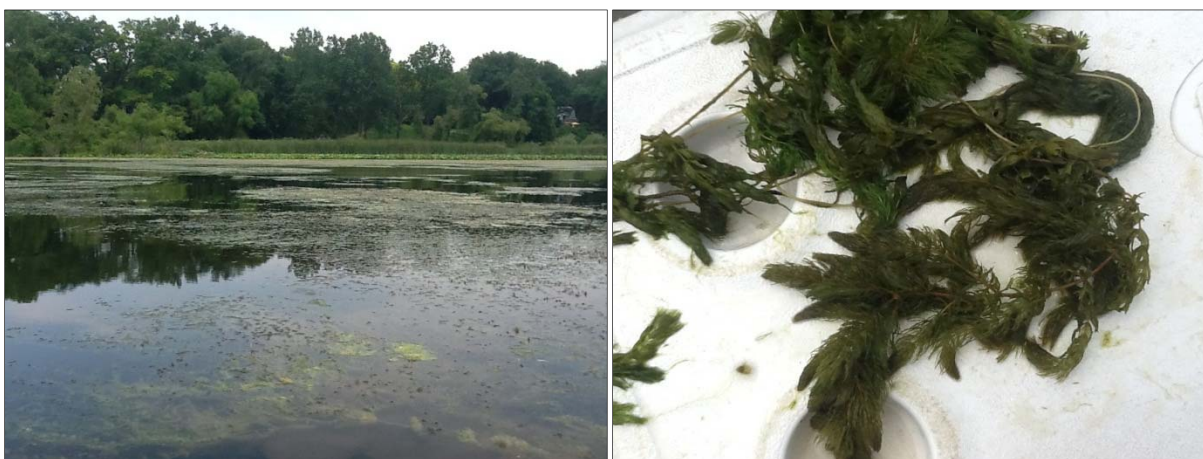
Figure 4. Coontail growing at the surface (left) and in detail (right).

Milfoil in the survey sites accounted for approximately 75% of the plant community in June and 50% in August at each site and was mixed with a total of sixteen native species: Bulrush ( Scirpus spp. ), Bushy pondweed/Slender Naiad ( Najas flexilis ), Chara ( Chara sp. ), Coontail ( Ceratophyllum demersum ), Eel grass/Wild celery ( Vallisneria americana ), Elodea ( Elodea canadensis ), Illinois pondweed ( P. illinoensis ), Sago pondweed ( P. pectinatus ), Slender naiad ( Najas flexilis ), Small pondweed ( P. pusillus ), Spadderdock ( Nuphar variegata ), Variable-leaf pondweed ( P. gramineus ), and White water lily ( Nymphaea odorata ).